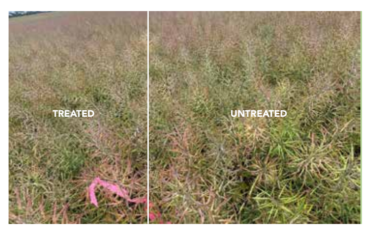
Res+ canola trial - treated and untreated